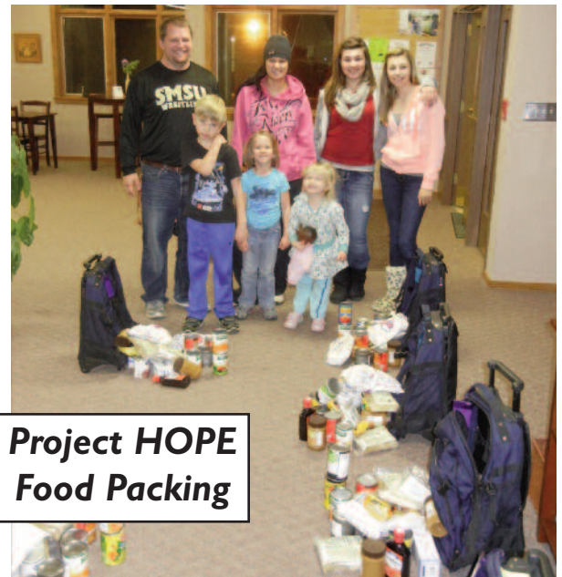
Project HOPE Food Packing