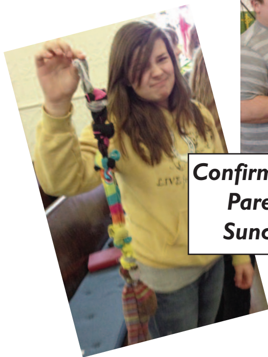
Confirmation Parent Sunday