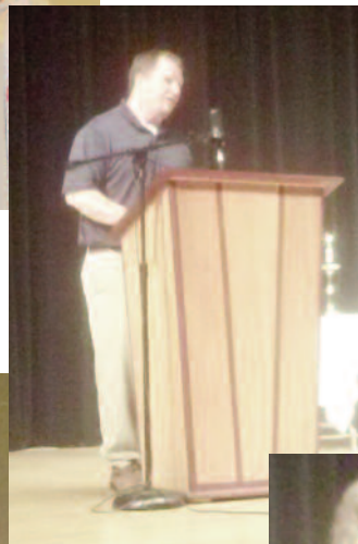
ACGC Baccalaureate Service