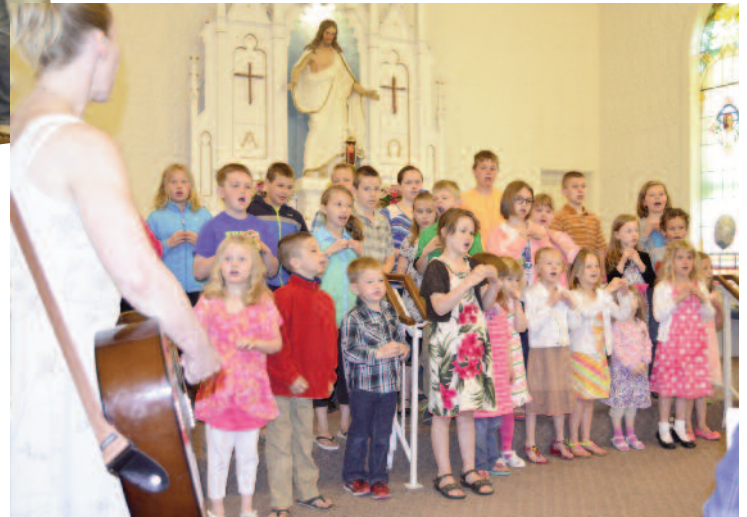
Sunday School Kids Sing