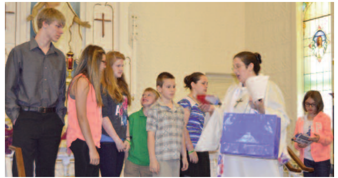
Bible Camper Blessing