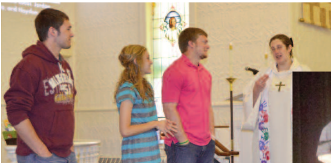
Recognizing Immanuel's Graduates