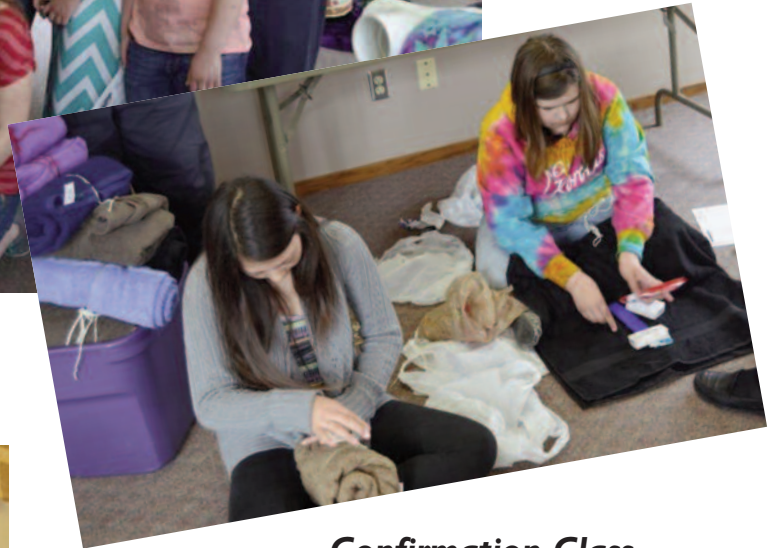
Confirmation Class packing the Lenten Giving Cross Health Kits for Lutheran World Relief.