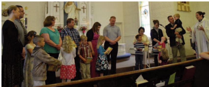
Kindergarteners Receive Bibles