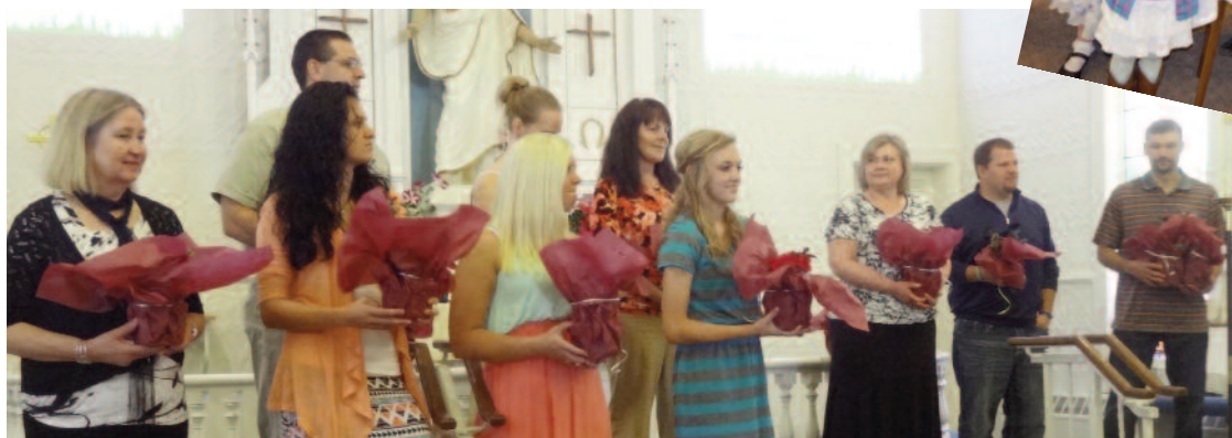
Recognizing Immanuel's Education Staff