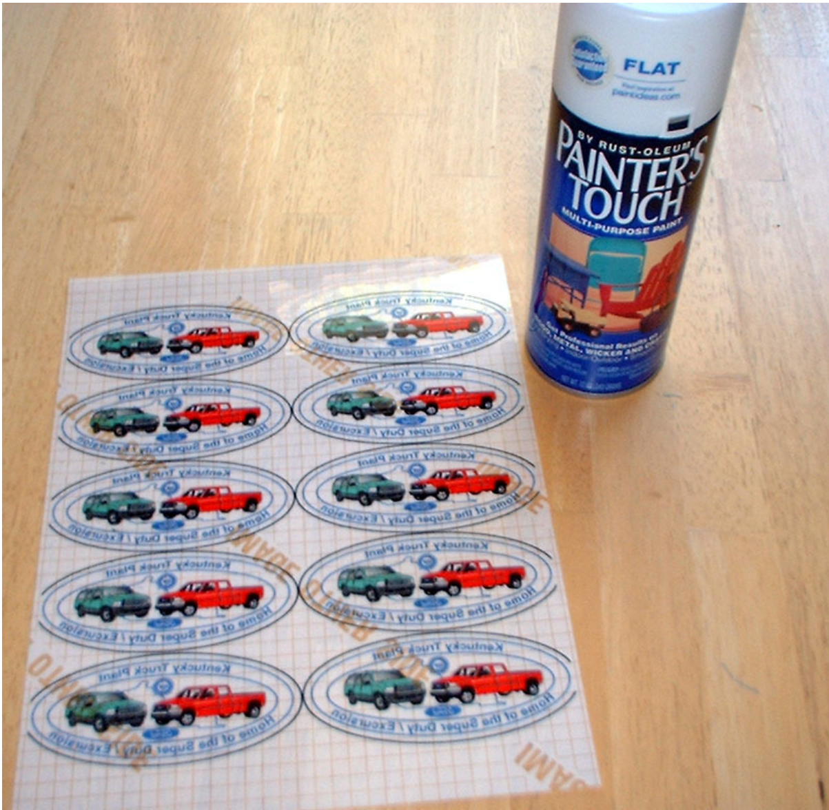
This is the result: