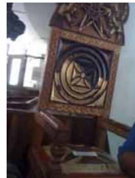
The last British Governor's chair which Ghana's first President, Dr. Kwame Nkrumah also used