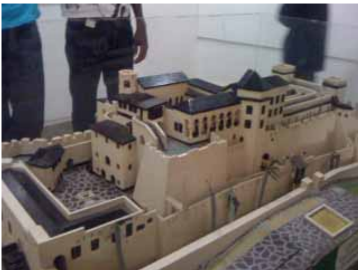
A model of the Christiansborg Castle at Osu