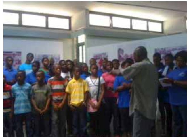
The Juniors and Cadets listening attentively to the instructor